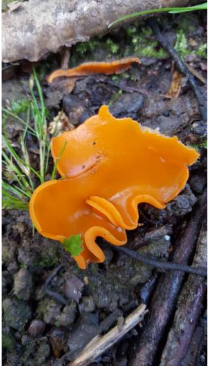
Orange Peel fungus

Software and hardware exist to record bird song, bat calls and the stridulations of grasshoppers and will give an immediate suggestion for the species involved. Long-worth live traps can capture small