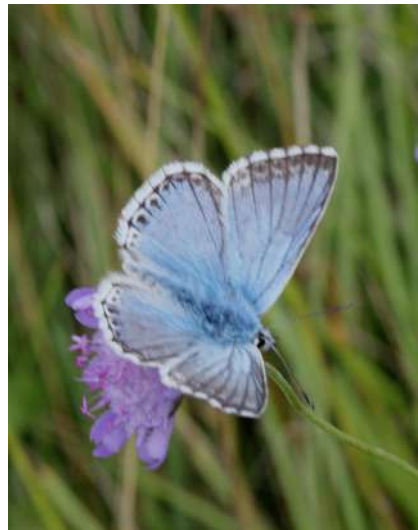
Chalkhill Blue butterfly

BIRDS: The British Trust for Ornithology (BTO) arranges various surveys one of which is the Breeding Bird Survey. This involves walking across a 1km map square (and back across on a parallel track) identifying every